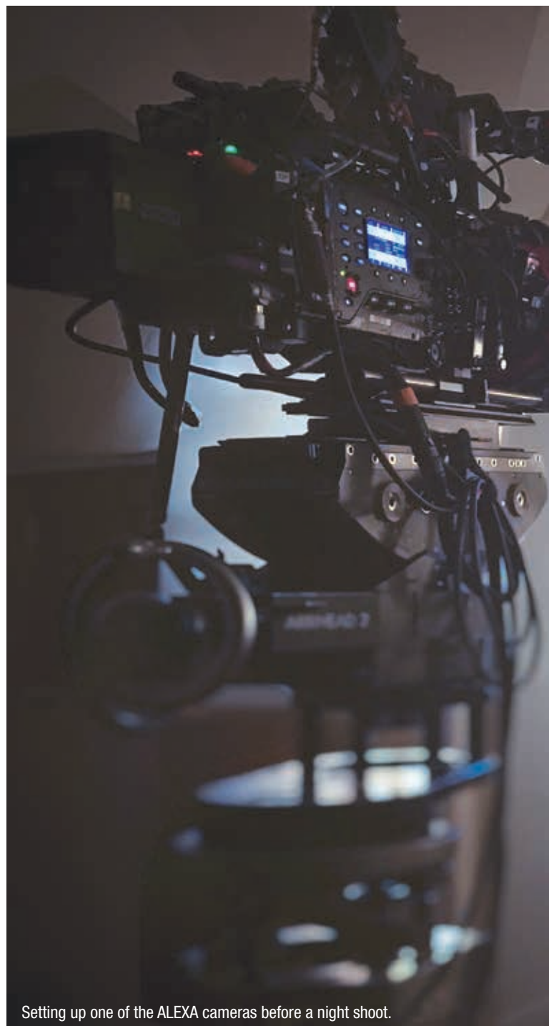
Setting up one of the ALEXA cameras before a night shoot.

One of the tools that I use a lot as a cinematographer is rear nets. I worked closely with Panavision to set up a set of magnetic rings that I could place inside the ALEXA cameras right at the back of the lenses. I became a cinematographer in London, U.K., and while there I had purchased a lot of this Fogal